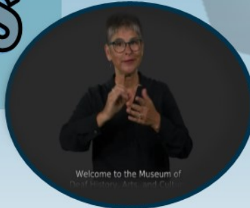
NEW "Welcome" Video