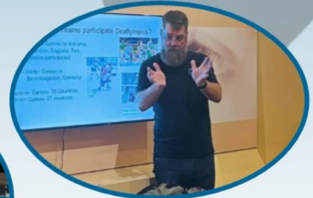
Immersive Hands-On Workshops