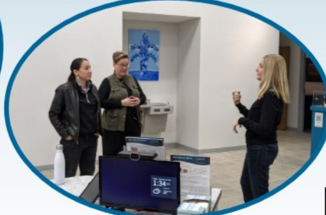
Private Docent Tours Representative Sharice Davids (KS-3)